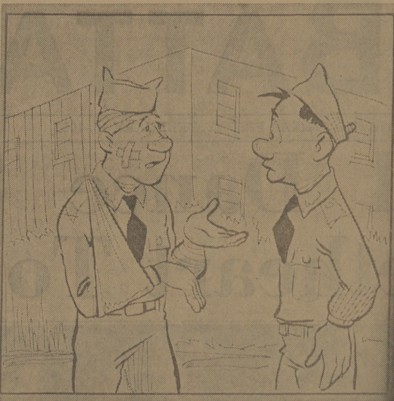
"... don't ever try to salute from a bicycle!"