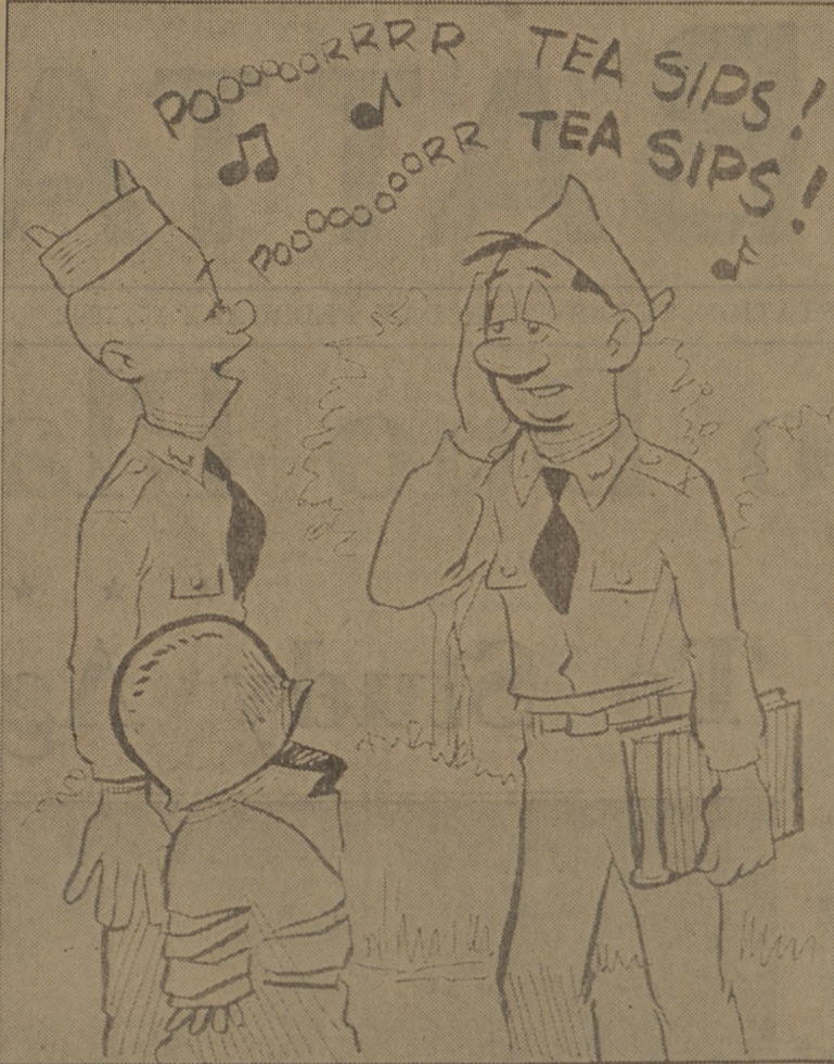
"... knock it off men—th' game was two nights ago!"