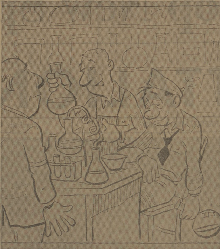
"... I never thought chemistry could be such fun!"