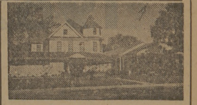
Hillier Funeral Home

A&M PRESBYTERIAN CHURCH 9:45 A.M.—Church School 11:00 A.M.—Morning Worship Wednesdays 9:45 A.M.—Church School 11:00 A.M.—Worship 6:15 P.M.—Training Union 7:15 P.M.—Worship