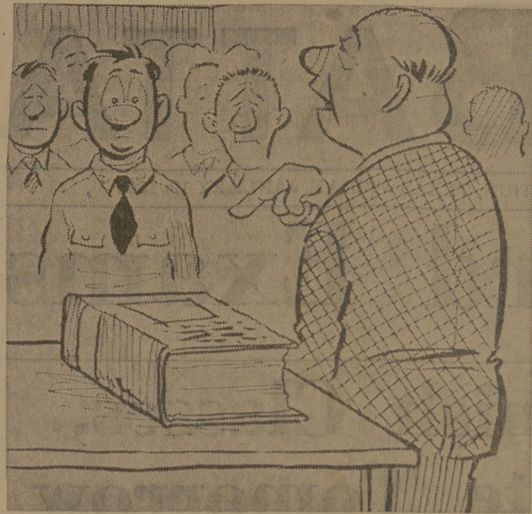
"... and there'll be nothing on your final exam not covered in your text!"