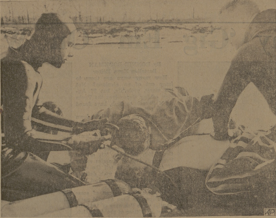
Saved From Drowning

The dormitory was situated on what is known as the Little Campus and adjoins the university scholastic league buildings.