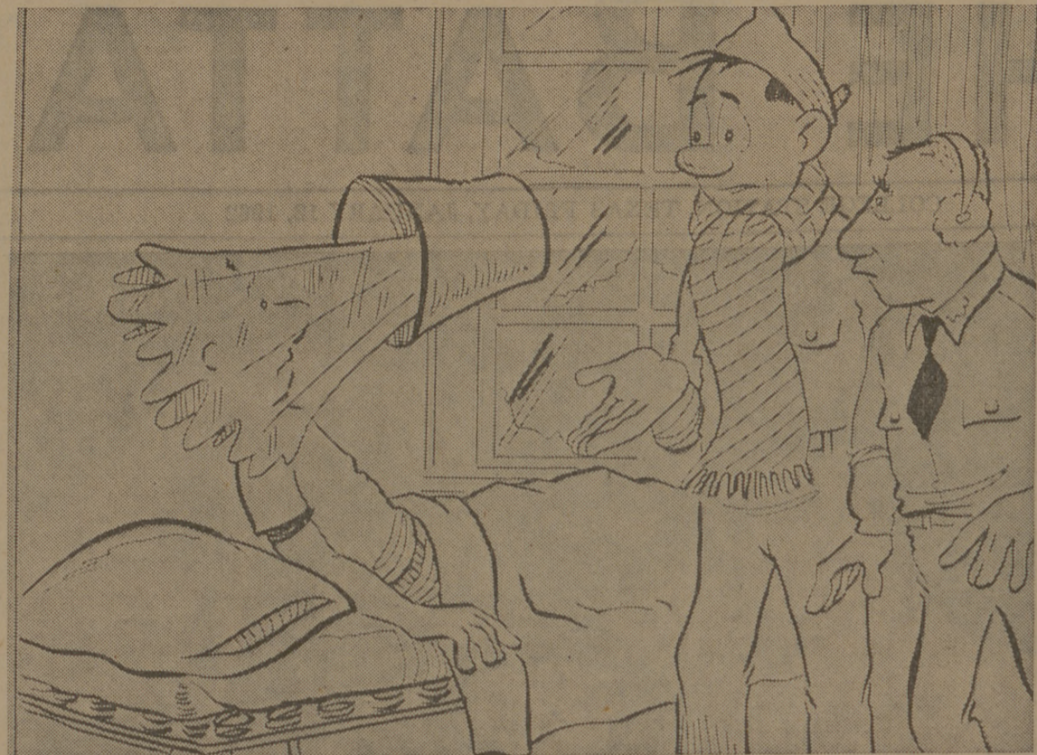
"Maybe we should have an outfit meeting and outlaw down-outs till after this cold spell!"

Social Clubs Chess Club will meet at 7:30 p.m. in the Memorial Student Center.