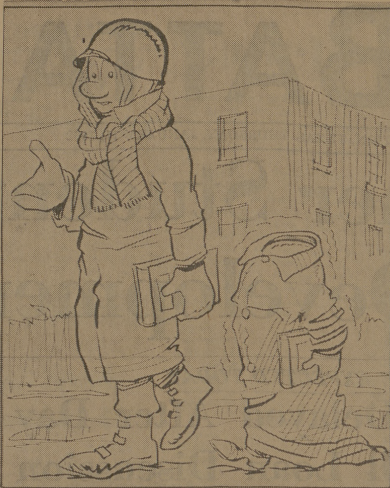
"I told you to wear more clothes didn't I?"