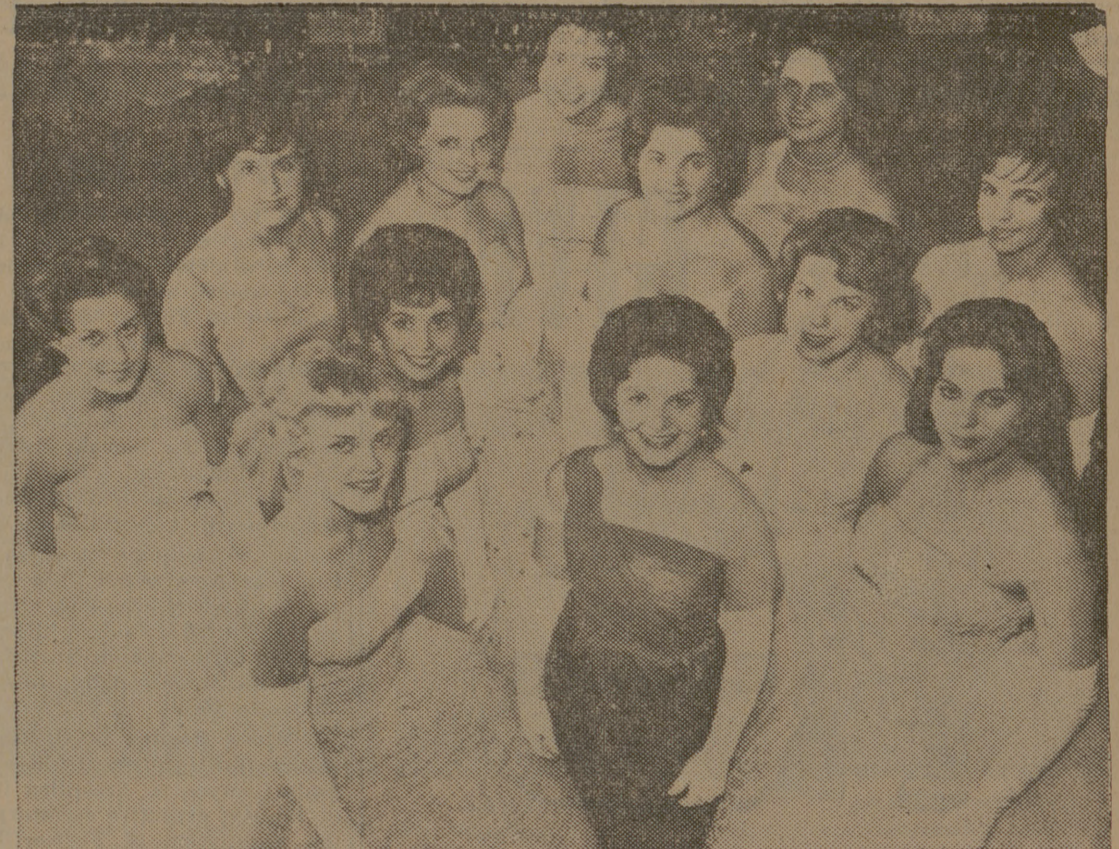
1962 North Texas Yucca Beauties

Near present-day 46th Street and the East River in New York City, royalist troops hanged Nathan Hale as a spy.