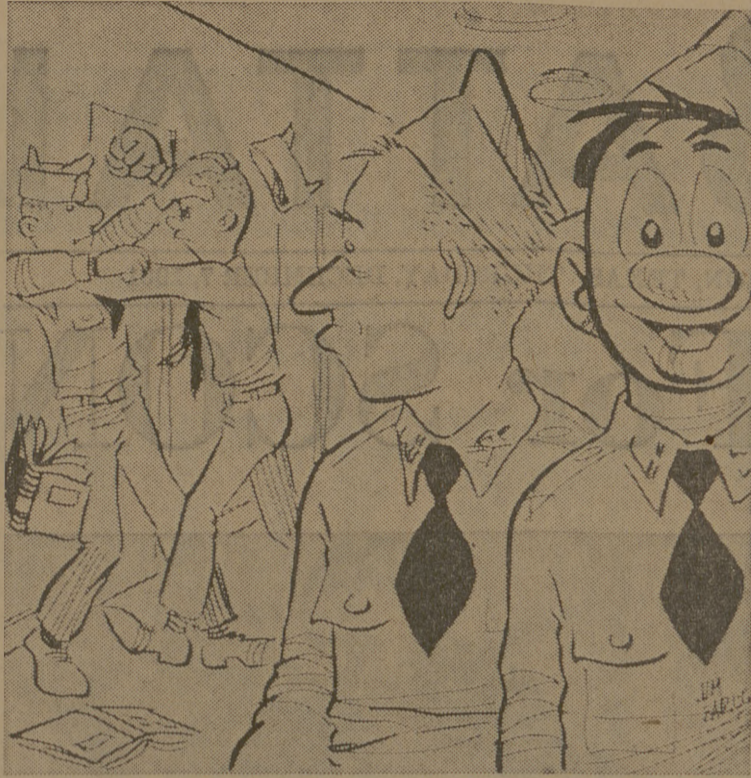
"There's no doubt about it... SCONA certainly has stimulated interest in politics!"