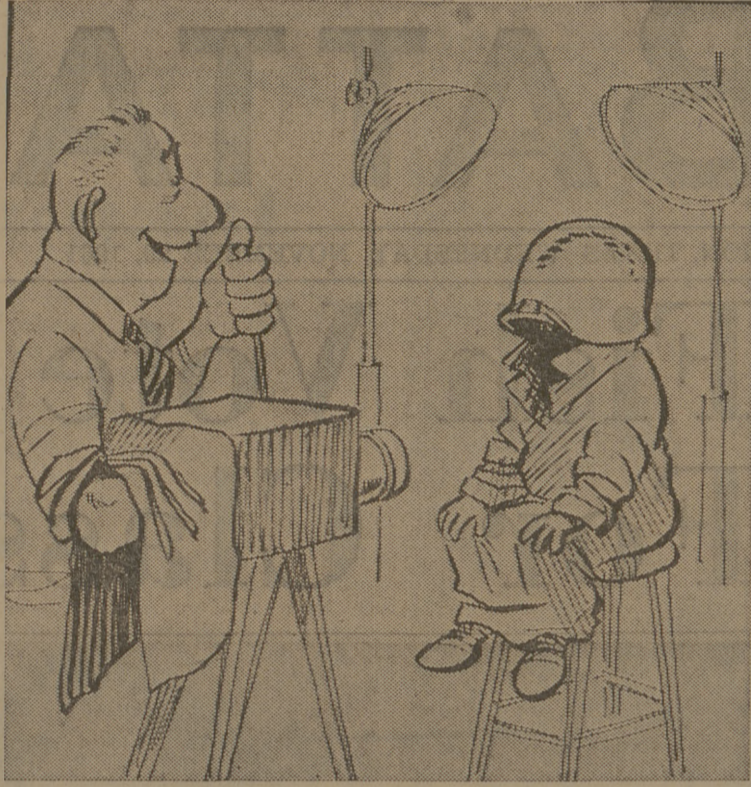
“... Smile ...”

WASHINGTON (AP)—The State Department charged Tuesday the Soviet Union and its satellites are using East Berlin as a springboard for their espionage activities against West Germany and other countries of the Western world.