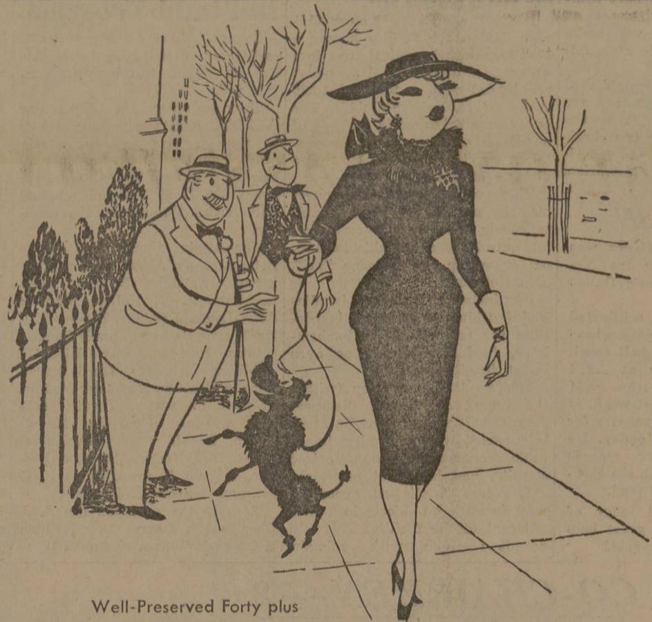
Well-Preserved Forty plus

Presented by Pall Mall Famous Cigarettes