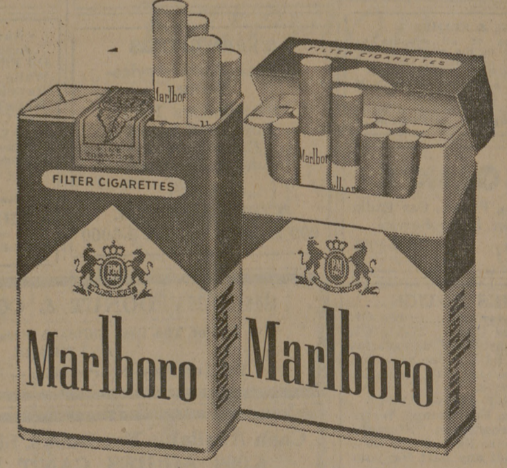
Flip-Top box or King-size pack

Try Marlboro and judge for yourself. On or off campus, you get a lot to like.