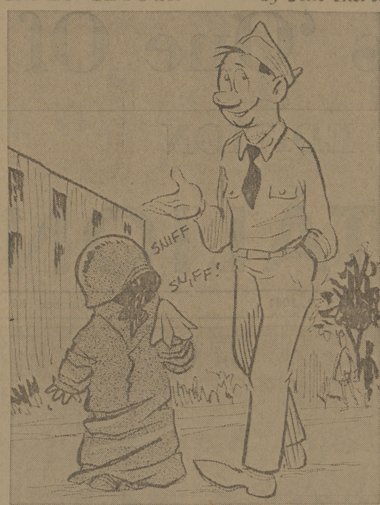
"... it just tears me up to think of T. U. dropping from No. 1 in th' nation to tie for No. 1 in th' conference!"