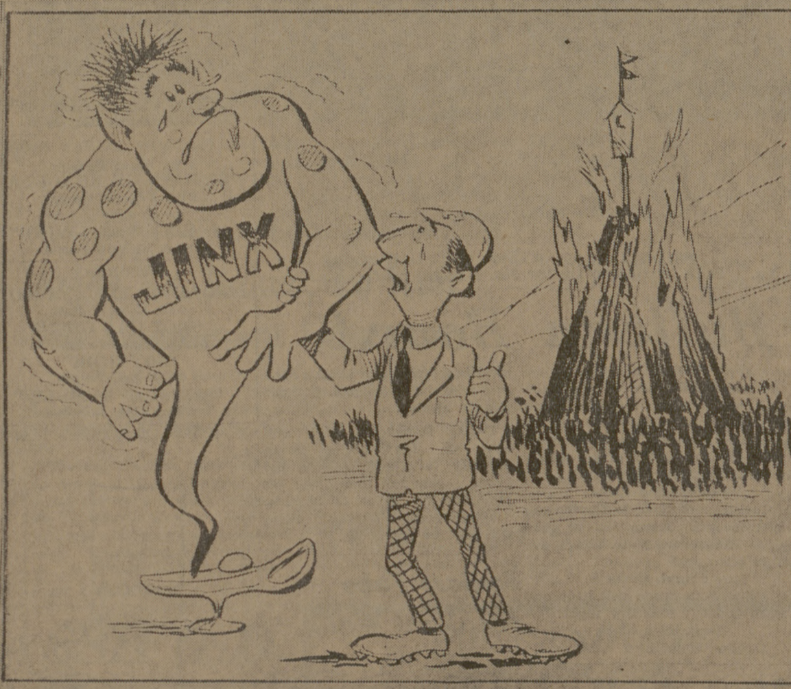
"... you've gotta pull yourself together!" Without you we're nothing!"