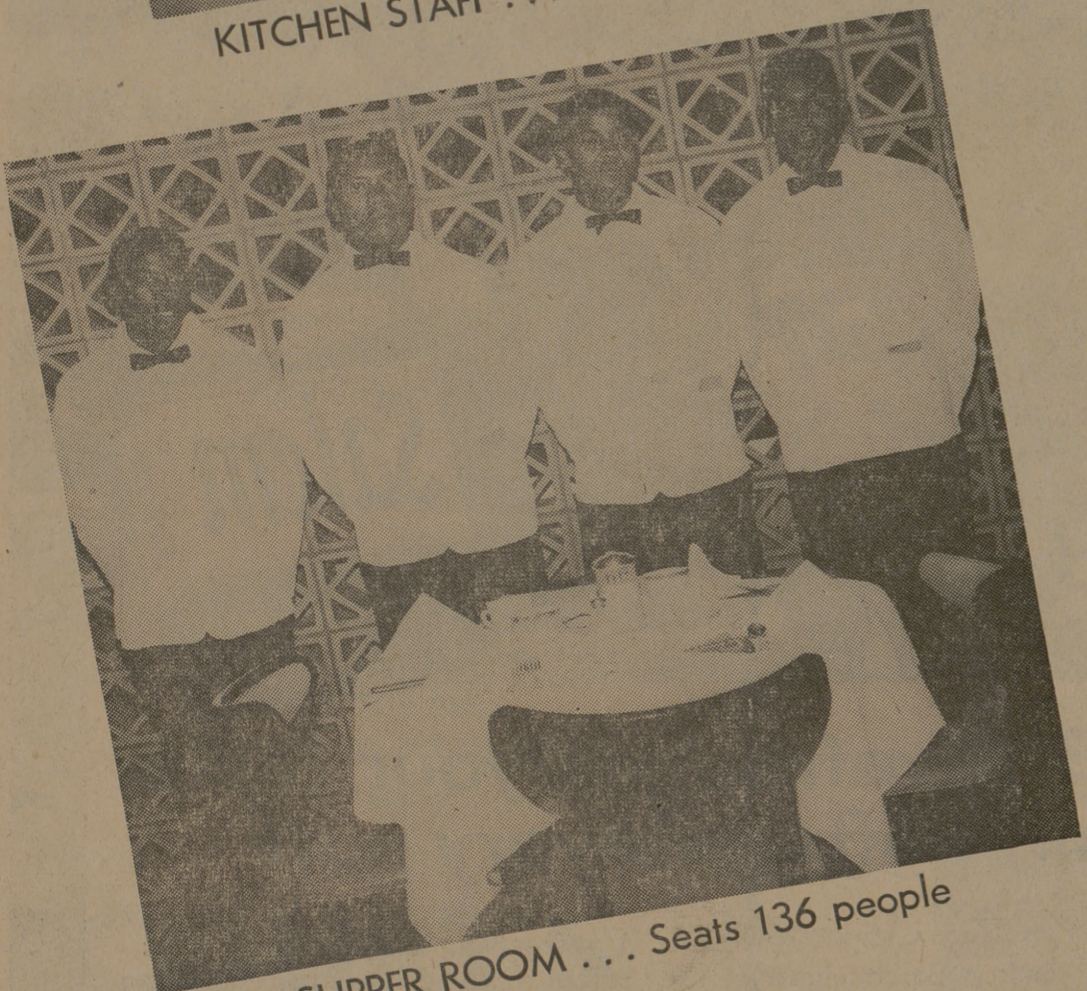
SUPPER ROOM . . . Seats 136 people

Your important date . . . just you two . . . or a banquet of 300—each occasion merits our most careful attention to your dining pleasure.