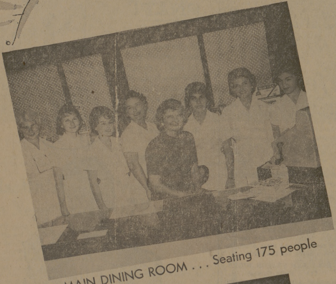
MAIN DINING ROOM . . . Seating 175 people

OUR SERVING HOURS ARE 11 A.M. 'TIL 12 MIDNIGHT, 7 DAYS A WEEK