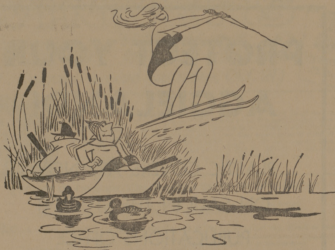
The nudge is permitted when a beautiful girl is sighted in an unusual place or at an unusual time.

Presented by Pall Mall Famous Cigarettes