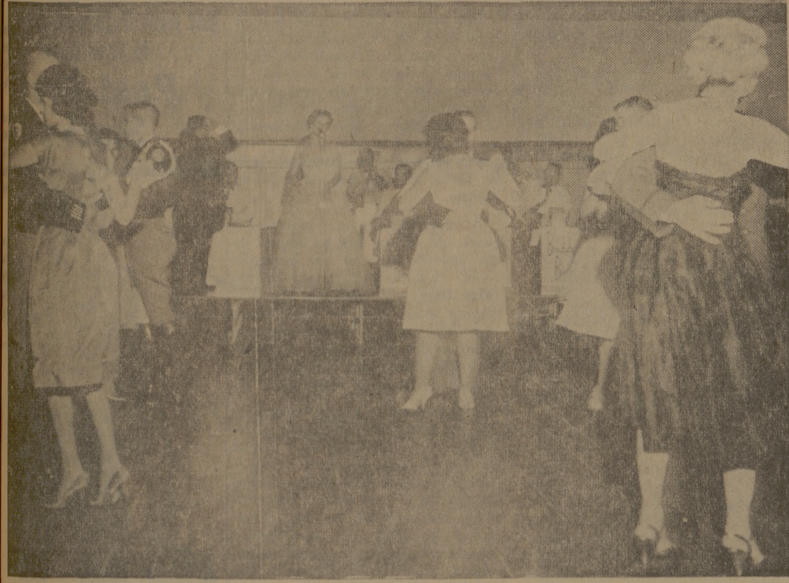
Feminine Charm In a Song

A soloist with Buddy Brock's orchestra seemed to enjoy at the Air Force Ball Friday night in Sbis Dining Hall.