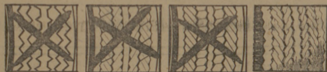
Not this... Not this... Not this... BUT THIS