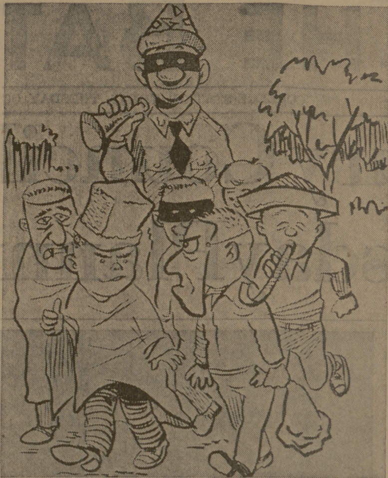
"I think we should set an age limit on these 'trick or treats' groups!"