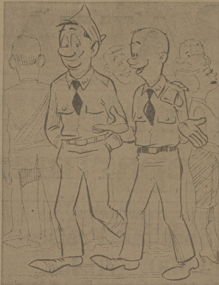
"... Didn't we beat Tech and didn't Tech beat TCU? Why shouldn't we start thinking about the 'Cotton Bowl?'"