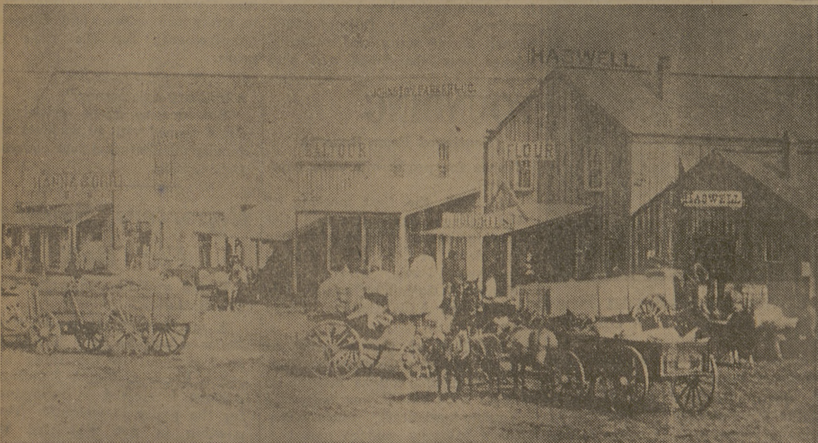
Bryan in 1867

These cavalry cadets are practicing saber drill, sporting wrapped leggings and campaign hats. The picture, taken in 1917, shows the Academic Building in the background.