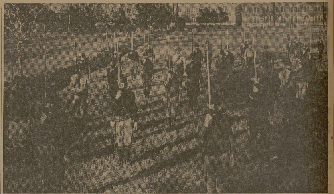
Old Army Saber Drill