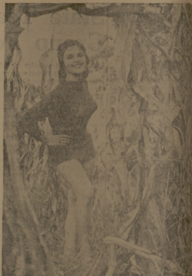
Fall In The Air