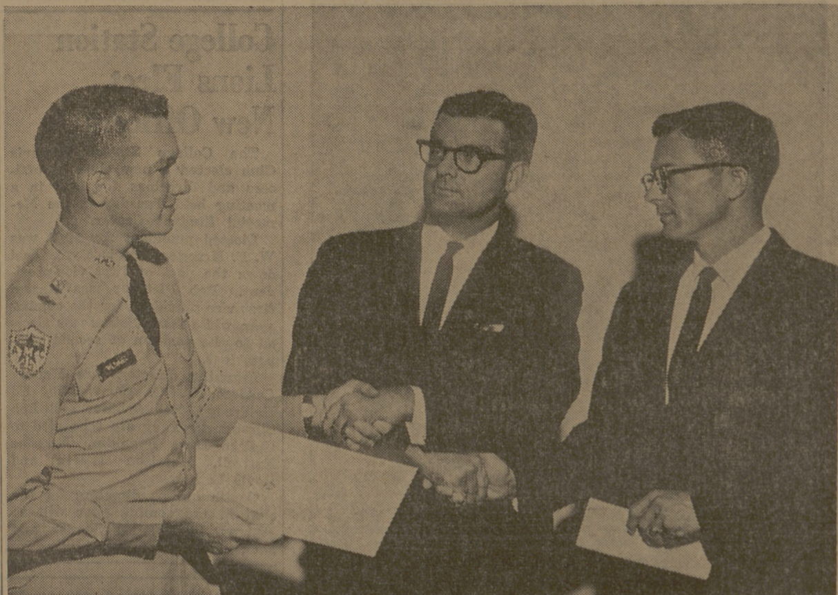
Top Award Winners

The college debate question to be discussed is: "Resolved: that labor unions should come under the jurisdiction of anti-trust legislation."