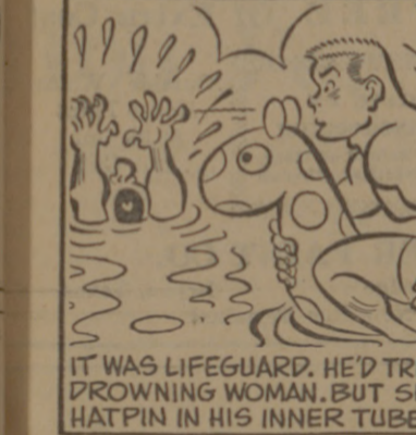
IT WAS LIFEGUARD. HE'D TRIED TO RESCUE DROWNING WOMAN. BUT SHE STUCK A HATPIN IN HIS INNER TUBE.