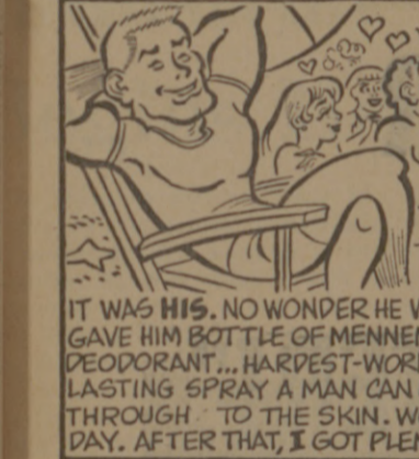
IT WAS HIS. NO WONDER HE WAS UNPOPULAR. GAVE HIM BOTTLE OF MENNEN SPRAY PEODORANT... HARDEST-WORKING, LONGEST-LASTING SPRAY A MAN CAN USE. GETS THROUGH TO THE SKIN. WORKS ALL DAY. AFTER THAT, I GOT PLENTY OF REST.