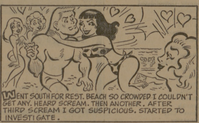
WENT SOUTH FOR REST. BEACH SO CROWDED I COULDN'T GET ANY. HEARD SCREAM. THEN ANOTHER. AFTER THIRD SCREAM I GOT SUSPICIOUS. STARTED TO INVESTIGATE.