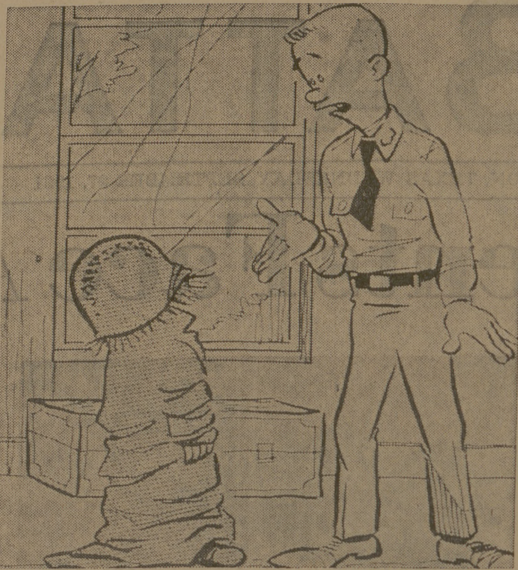
"... They're letting us fish have longer hair this year, but yours may be longer than regulation permits!"