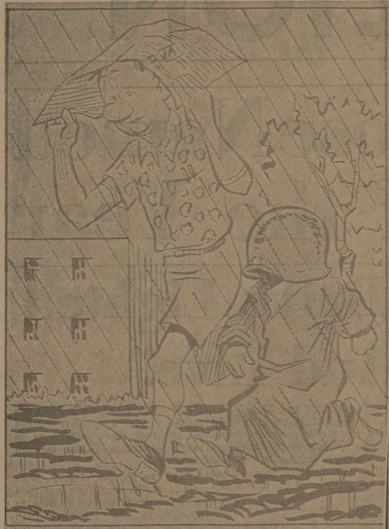
"... When it rains like this, I get th' feelin' I should be workin' on th' bonfire!"