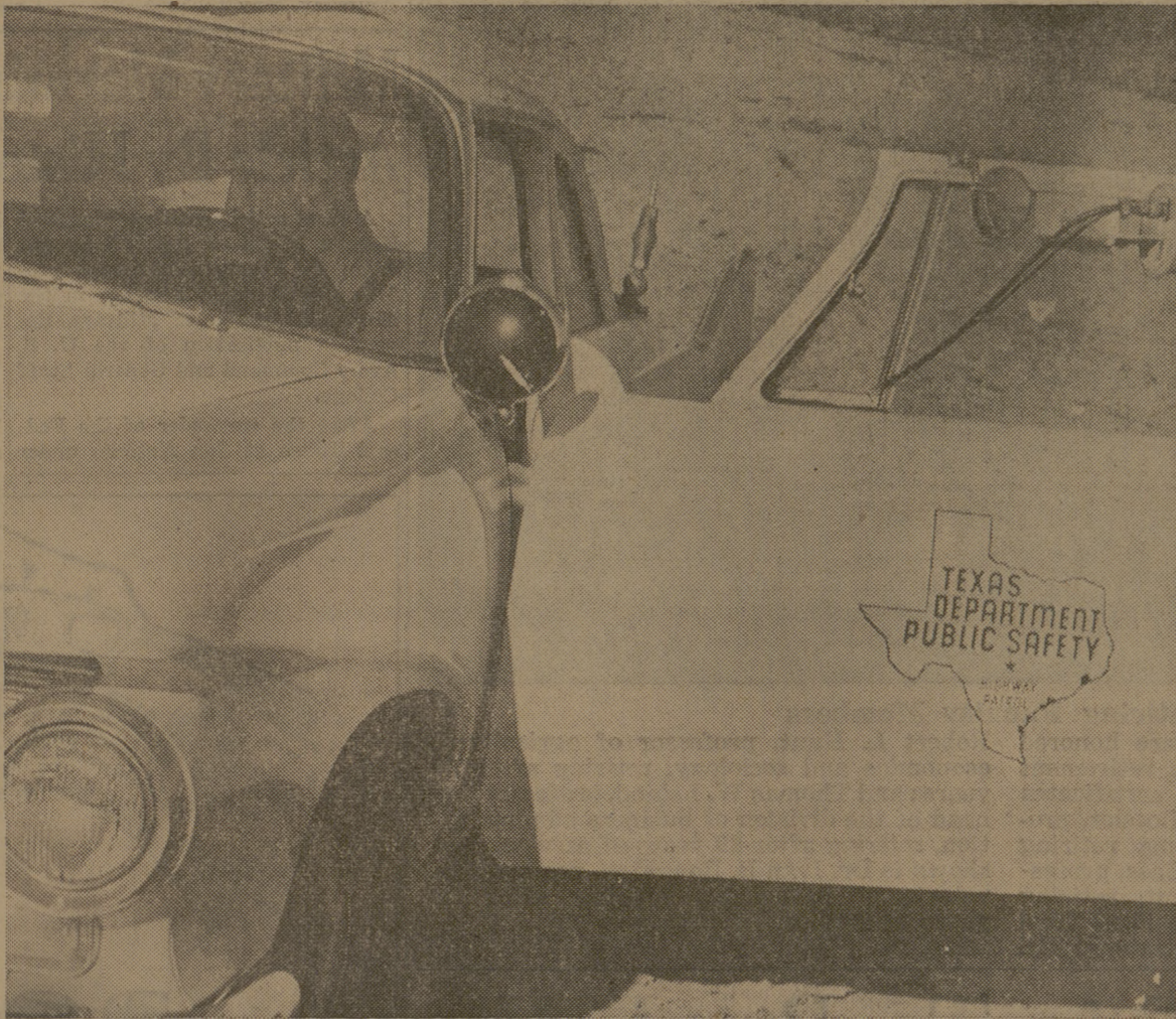
Wynn Williams In Unit 6240 ... checks speed of oncoming car with radar