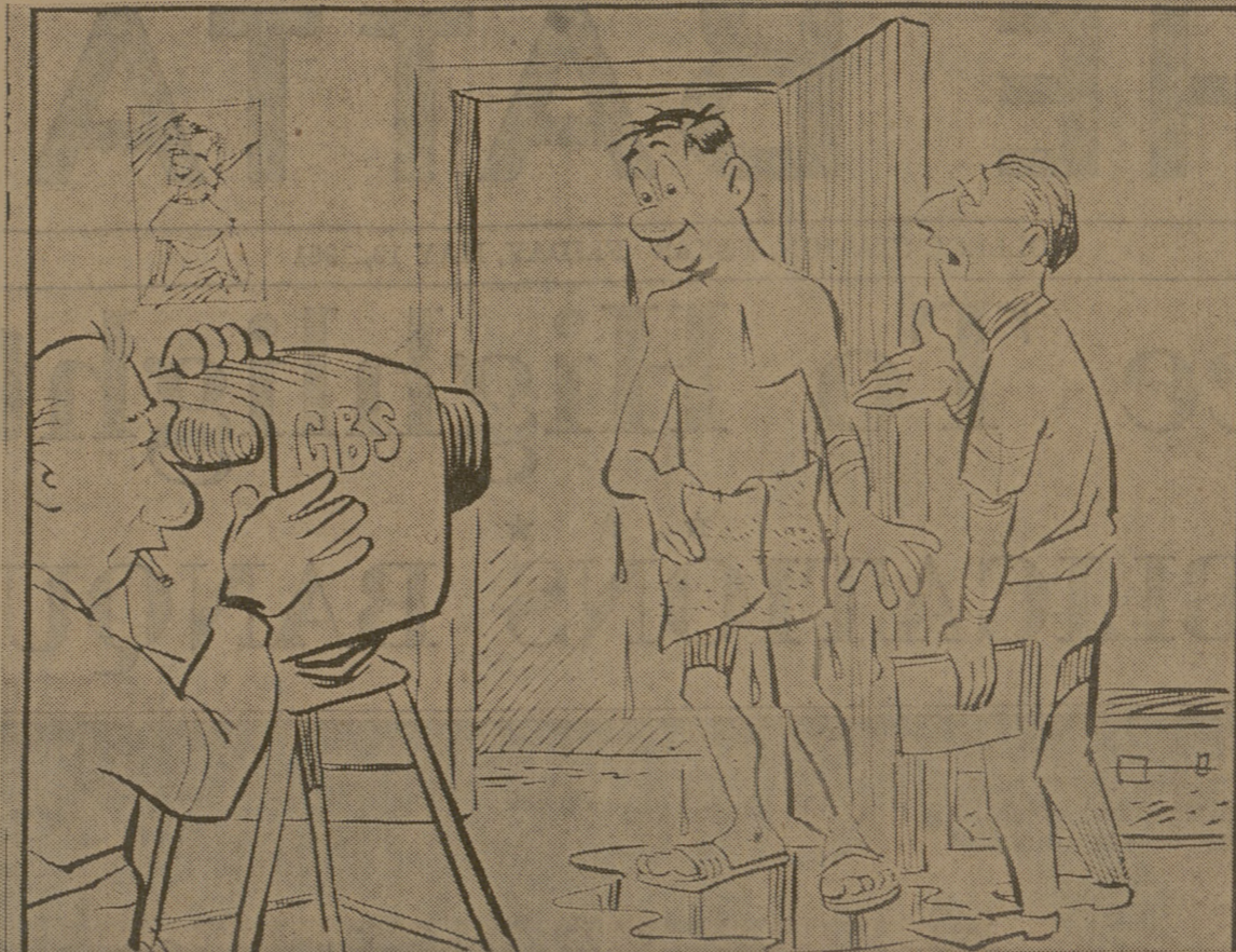
"... Be calm and act natural—you're on national TV!"