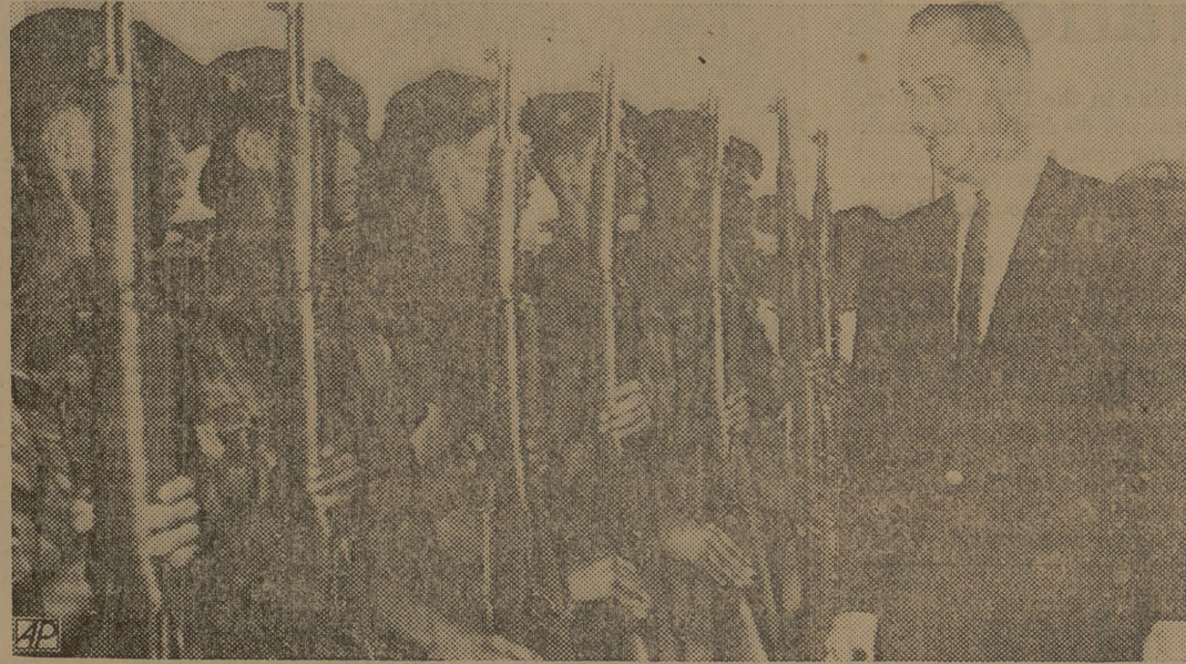
Johnson Inspects Honor Guard At Saigon Vice President Lyndon Johnson was given guard of South Viet Nam's President Ngo Dinh Diem, at the Saigon airport.

Secretary of State Rusk also told the conference here that the Pathet Lao rebels were violating the cease-fire in Laos repeatedly.