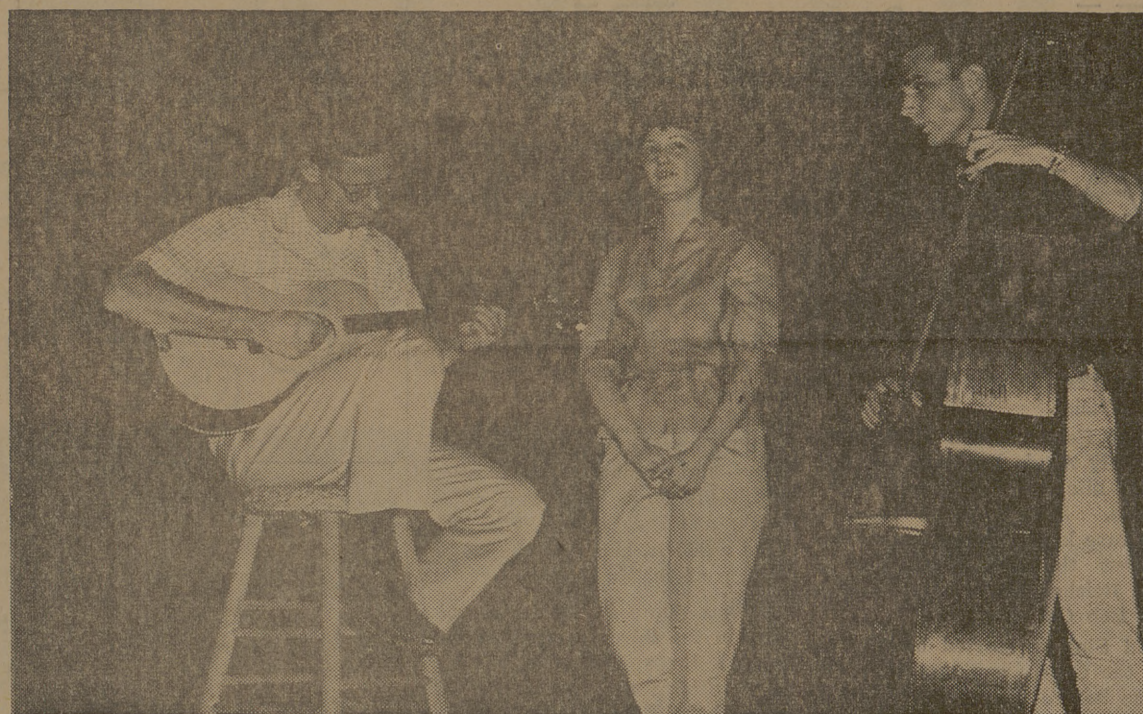
Aggie Players ... preping for follies

Many other acts will provide an evening of pure entertainment for all attending the Aggie Follies, 1961.