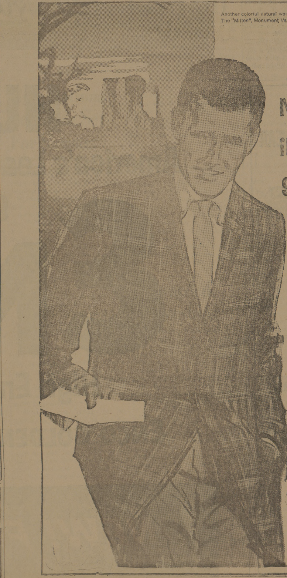
Another colorful natural wonder: The "Mitten", Monument Valley, Utah

SOSOLIK'S T. V., Radio, Photo., Car Radio Transistor Radio Service 713 S. Main TA 2-1941