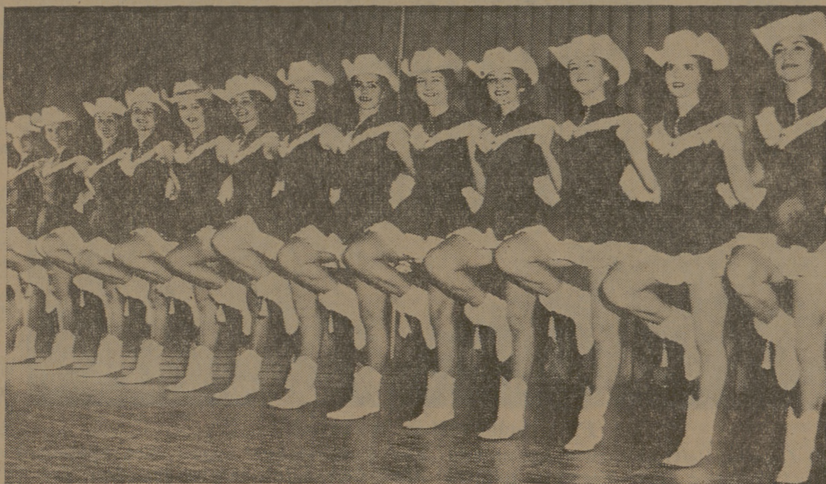
A&M Consolidated's Bengel Belles ... to perform during weekend Aggie Follies

Many other acts will also highlight the evening of entertainment, including professional drummers, magicians, dancers, and other intriguing acts. The show will play two nights, Friday and Saturday, May 11 and 12, in conjunction with Parents' Weekend.