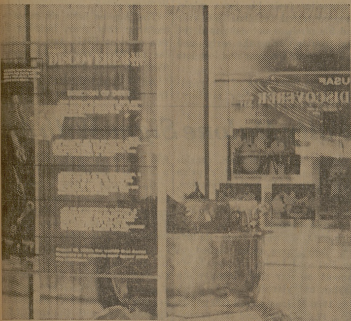
Discoverer XIV displayed in the MSC