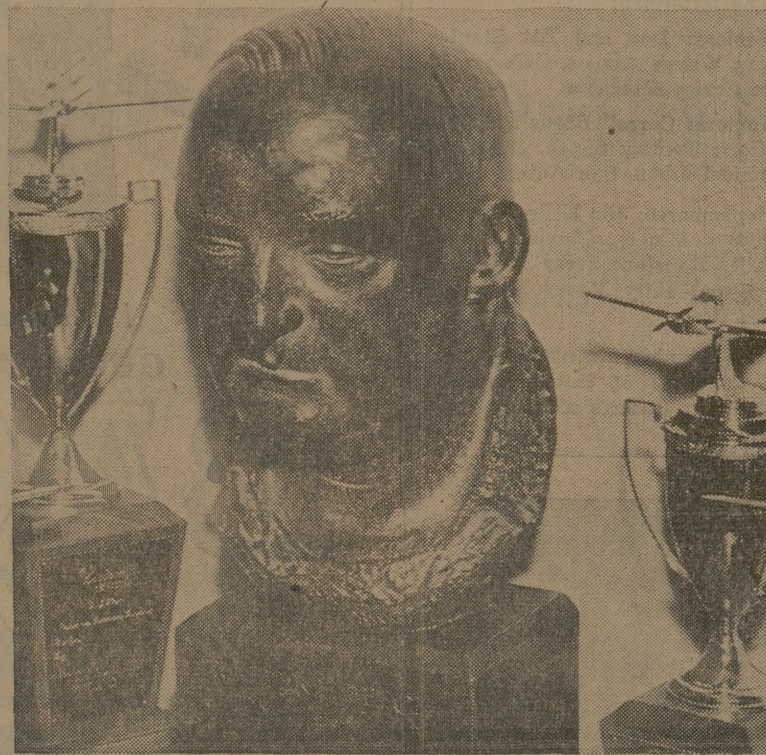
Beech Aircraft Trophies ... one of many to be awarded