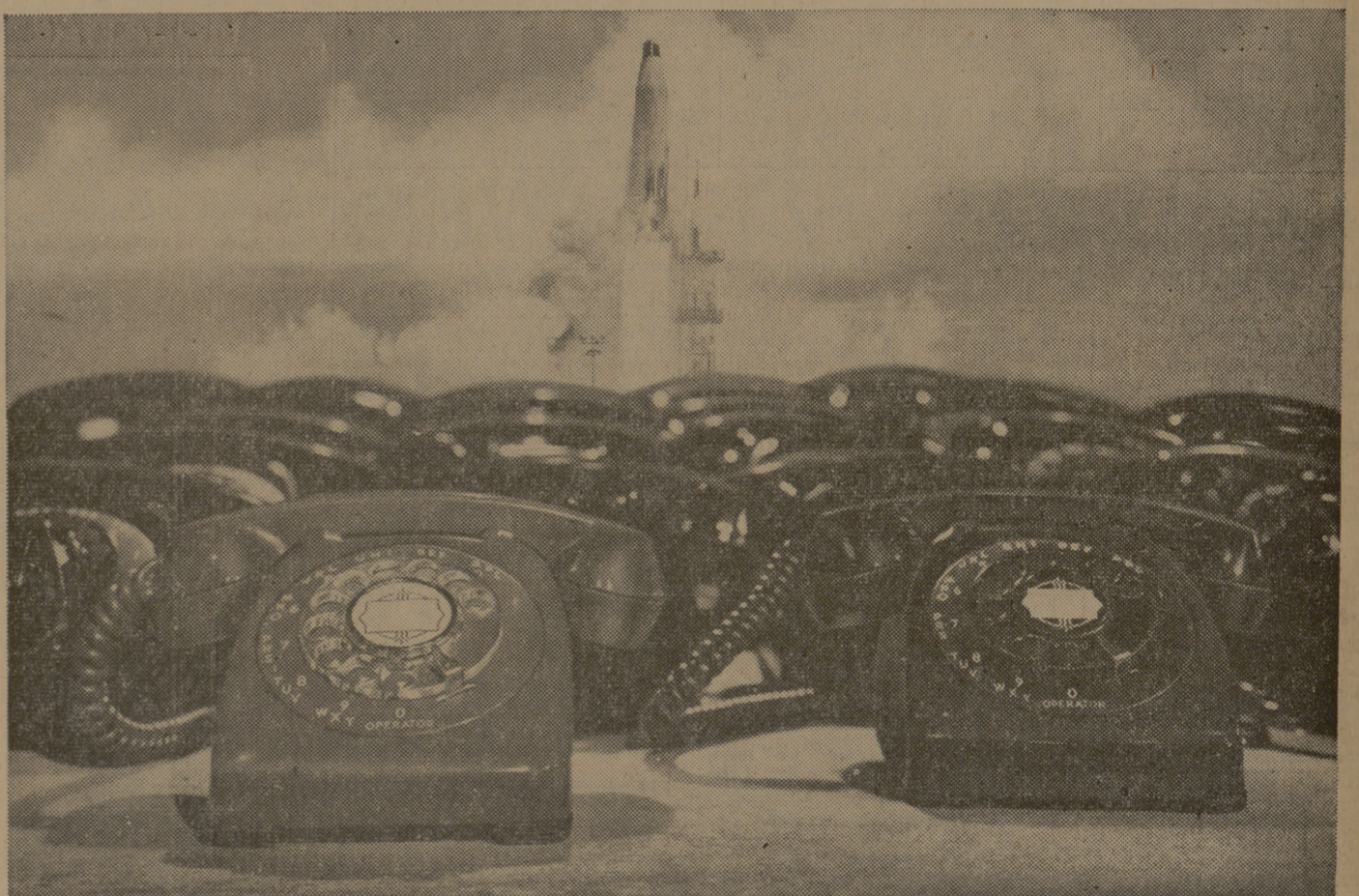
Massive voice for a missile base

In America's space-age defense system, the order of the day is total, high-speed communications. And at Vandenberg Air Force Base, as elsewhere, General Telephone & Electronics is carrying out the order with efficiency and dispatch.