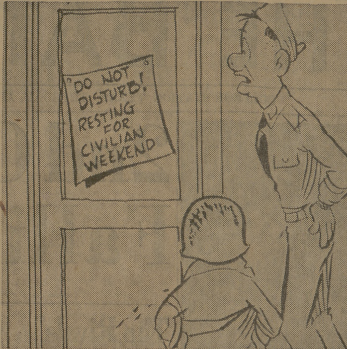
... must have a pretty good weekend lined up."