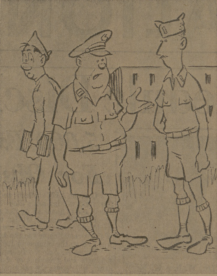
"... I can take their sly glances and smiles—it gets to me when they whistle."