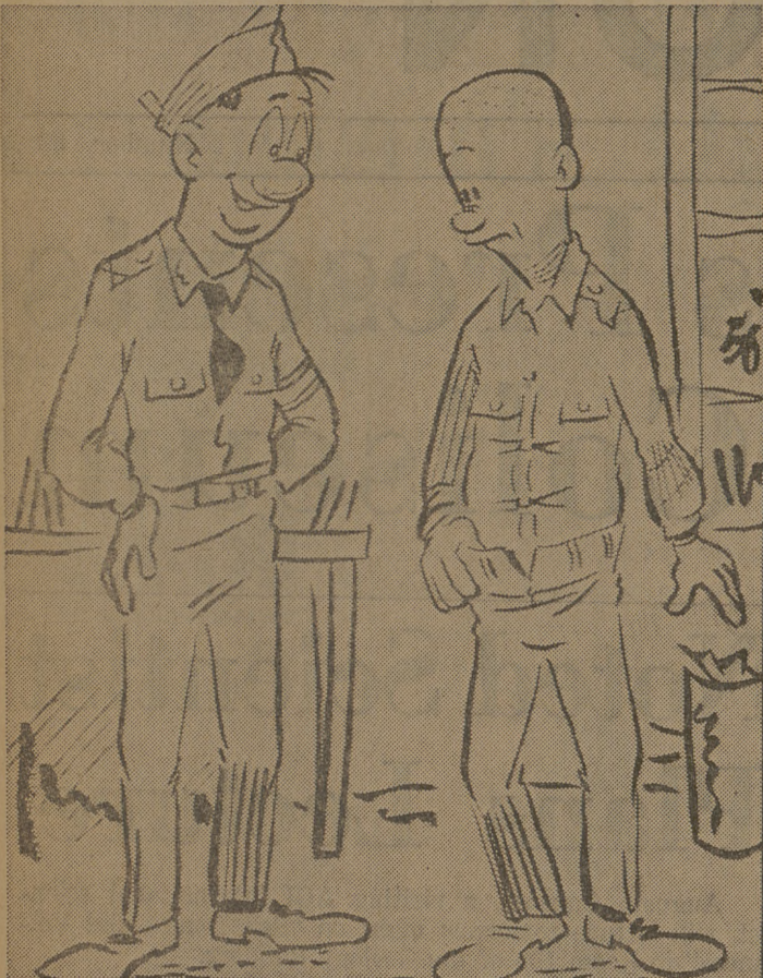
"Since you say you never get enough to eat in th' chow hall —your khakis must have shrunk!"