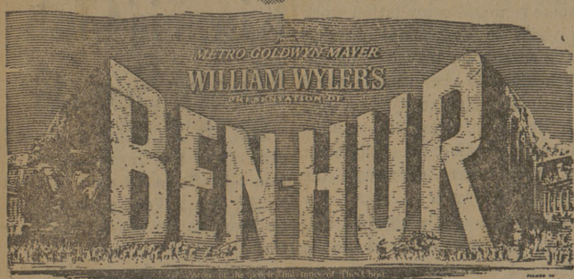
The Gigantic Sea Battle.

ADMISSION MATINEE NITE... ALL PASSES DISCONTINUED DURING THIS PERFORMANCE