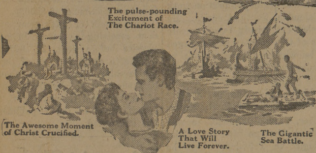
The Awesome Moment of Christ Crucified.