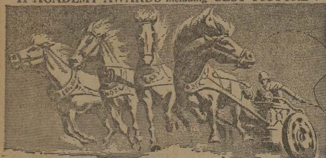
The pulse-pounding Excitement of The Chariot Race.

11 ACADEMY AWARDS including "BEST PICTURE!"