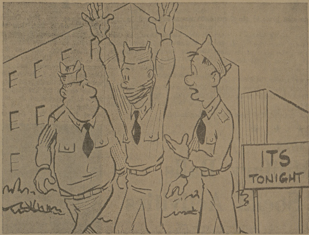
"... we had to shut him up somehow. Every time someone mentioned that the Kilgore Rangerettes were gonna be in the Intercollegiate Talent Show, he'd go wild. And there he goes again!"