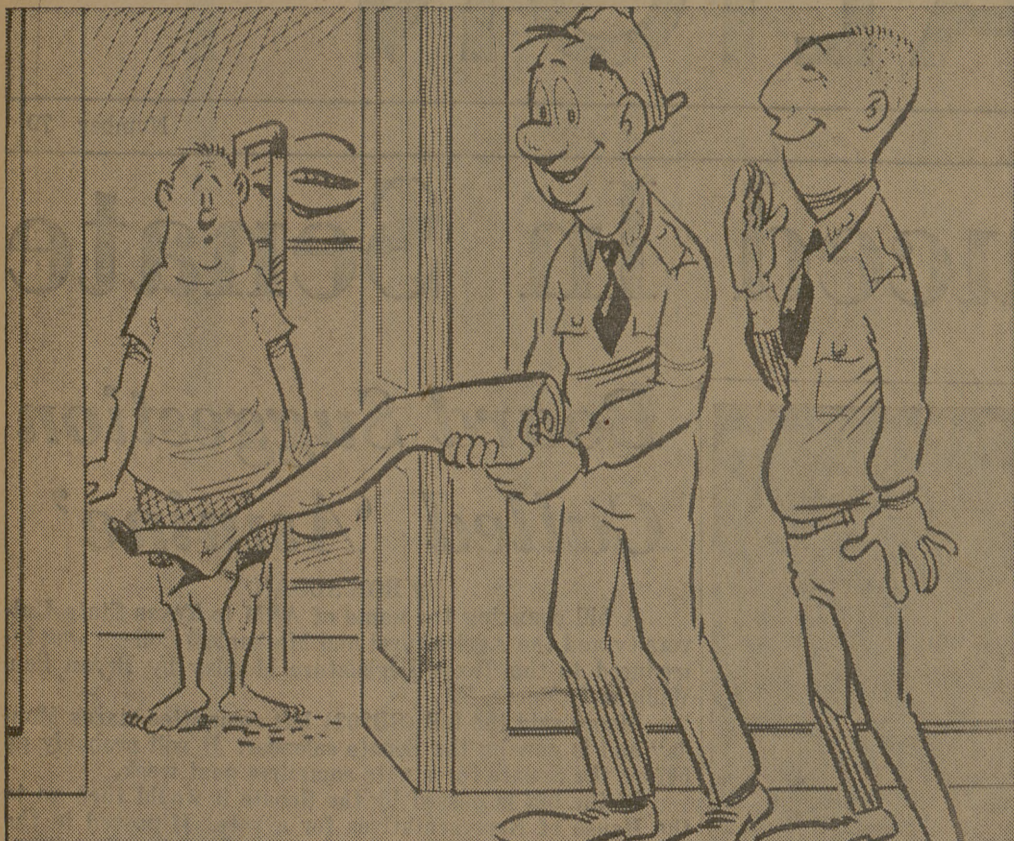
"... th' last guy cried when he found out that it was only a manikin leg!"