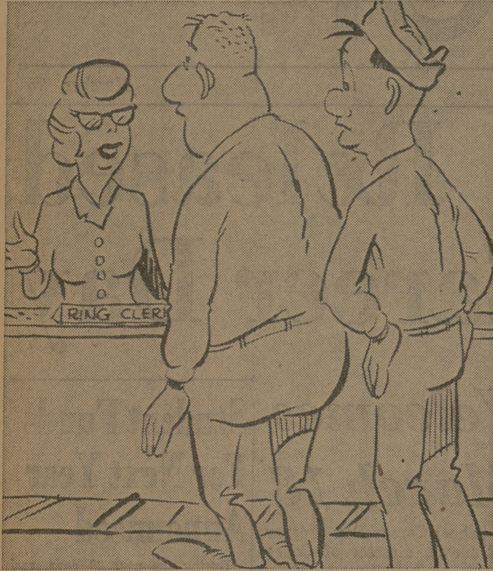
"... I'm sorry you misunderstood eligibility for a senior ring is based on hours passed—not failed."