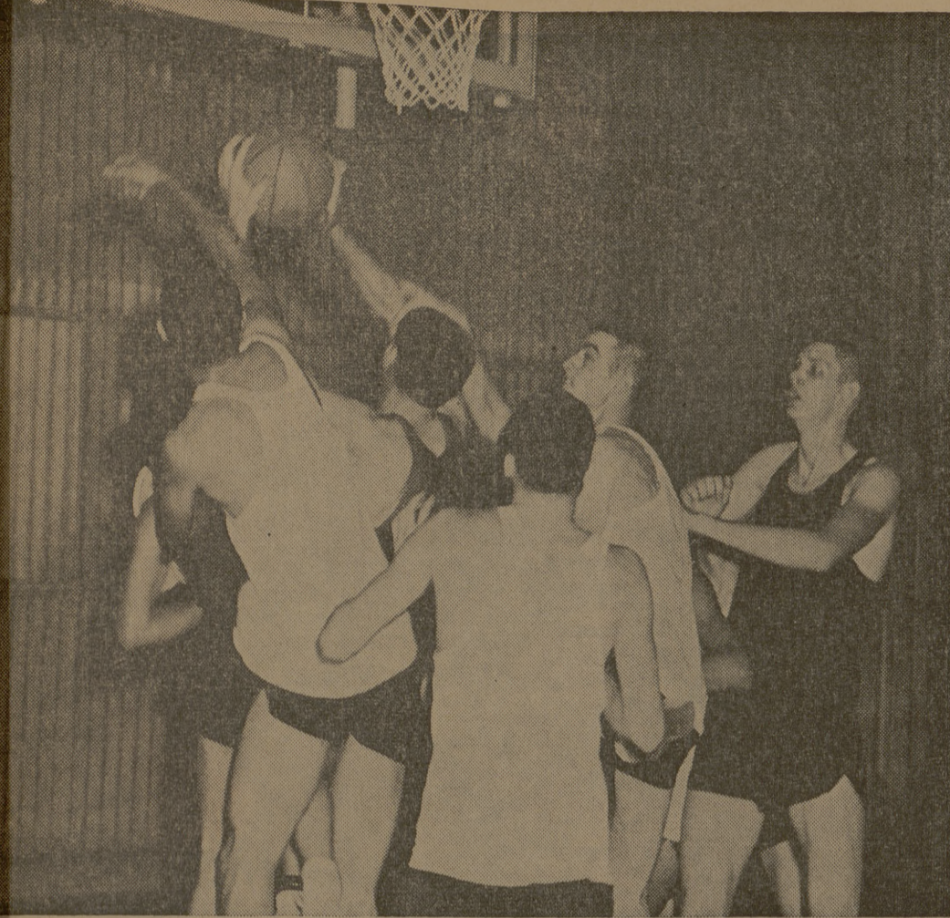
Aggies Prep For Tech

Ruling that colleges may not pay expenses for athletic talent scouts in recruiting and may not claim he is a staff member and entitled to expenses by paying him a regular fee.