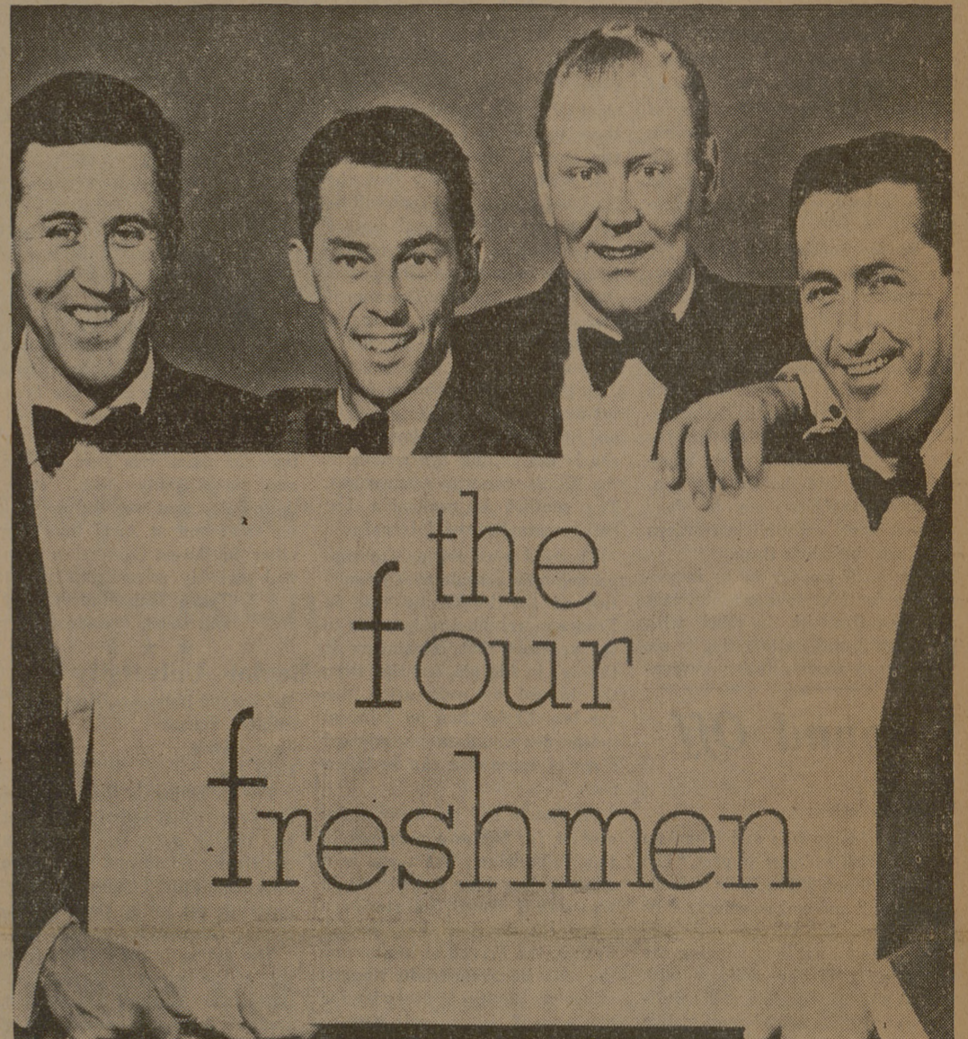
Famed Four Freshmen ... Appear here Thursday night

Selections for the "Four Freshmen's program tomorrow night will be taken from a list of 33 songs.