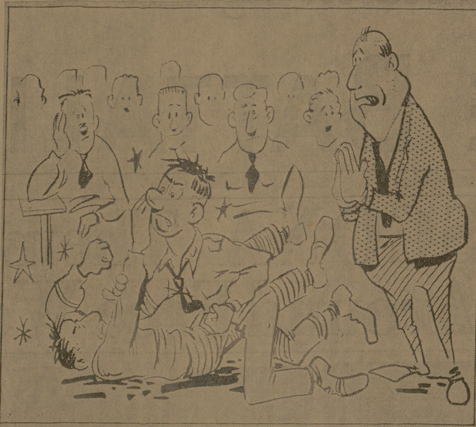
... gentlemen, I think we should end this informal discussion on whether or not we should change the name of A&M!"