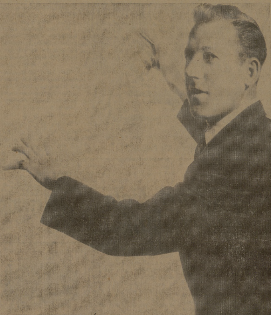
Stereo Magician Ray Conniff ... hailed as music event of year