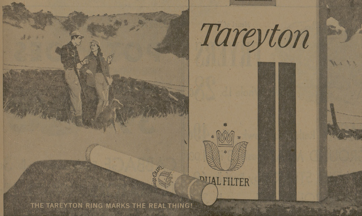
THE TAREYTON RING MARKS THE REAL THING!

Filters for flavor —finest flavor by far!