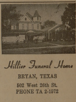
Hillier Funeral Home BRYAN, TEXAS 502 West 26th St. PHONE TA 2-1572