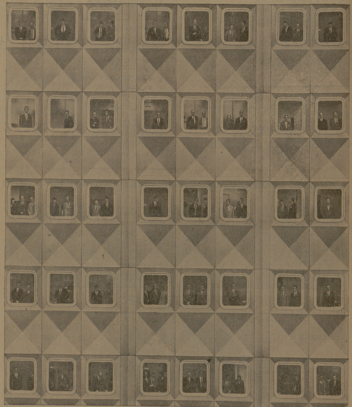
East wall of Alcoa's all-aluminum skyscraper, Pittsburgh