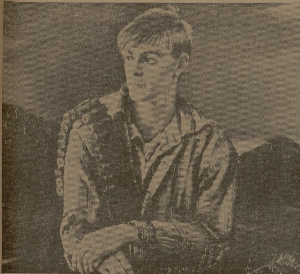
"The Young Hunter"