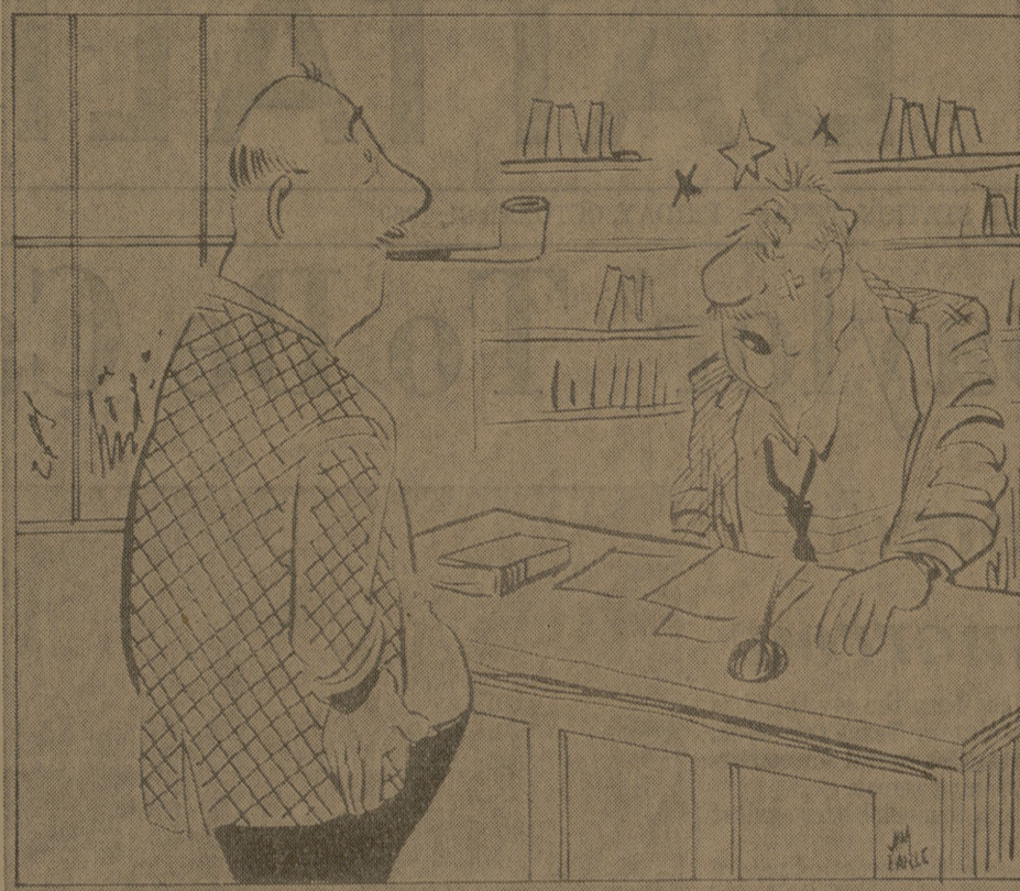
... I wouldn't have assigned that quiz for Monday if I knew they took these free weekends so seriously!"