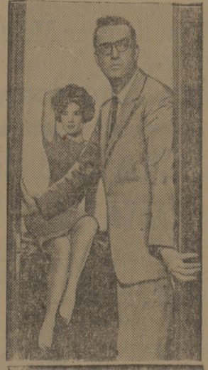
STEVE ALLEN · JAYNE MEADOWS · WALTER WINCHELL · MAMIE VAN DOREN COLLEGE CONFIDENTIAL an ALBERT ZUGSMITH production A Universal-International Release

Executive officers and 1st sergeants will have portrait made in GH cap. Commanding officers will have boots. PLEASE MAKE APPOINTMENT FOR THESE FULL LENGTH PORTRAITS, AT THE STUDIO. Oct. 24 - 25 Comp. A B C D (1st Brigade) Oct. 25 - 26 Comp. E F G H (1st Brigade) Oct. 26 - 27 Comp. A B C D (2nd Brigade) Oct. 27 - 28 Comp. E F G H (2nd Brigade) Oct. 31 - Nov. 1 Comp. G I K L M (2nd Brigade) Nov. 1 - 2 Squadrons 1, 2, 3, 4 Nov. 2 - 3 Squadrons 5, 6, 7, 8 Nov. 3 - 4 Squadrons 9, 10, 11, 12 Nov. 7 - 8 Squadrons 13, 14, 15, 16, 17 Nov. 8 - 9 Maroon & White Band All men in the corps on any staff, BOTH JUNIORS AND SENIORS, will have their portrait made for the "Aggieland '61" according to the following schedule. Nov. 9-10 Corps Staff, Cons. Band Nov. 10 - 11 1st Brigade, 1st and 2nd Battle Group Staffs Nov. 14 - 15 2nd Brigade, 3rd, 4th, and 5th Battle Group Staffs Nov. 16 - 17 1st Wing, 1st, 2nd Group Staffs Nov. 16 - 17 2nd Wing, 3rd and 4th Group Staffs