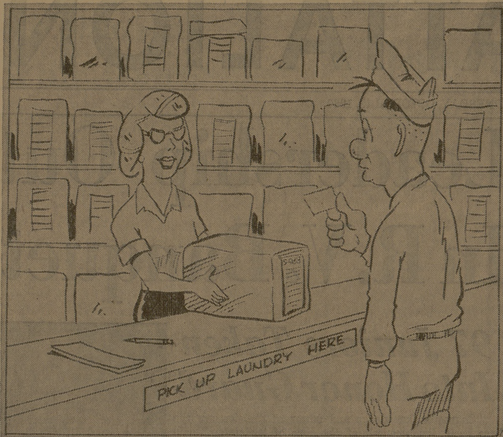
... by the way, SX-948, where have your friends, BX-925, JX-720 and CX-314 been?"