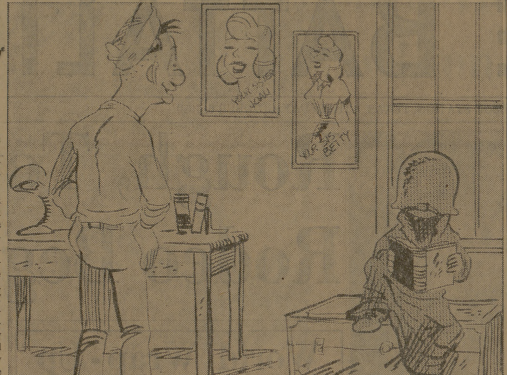
"... fish Squirt, ol' buddy, why don't you and I drop handles?"